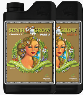
pH Perfect® Sensi Grow Coco A&B