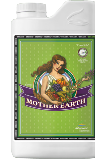
Mother Earth Super Tea Organic OIM